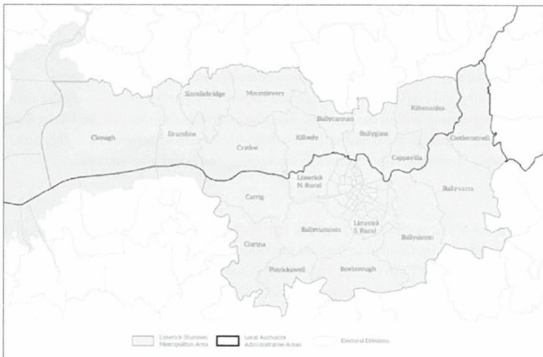
Figure 4.1 Limerick-Shannon Metropolitan Area