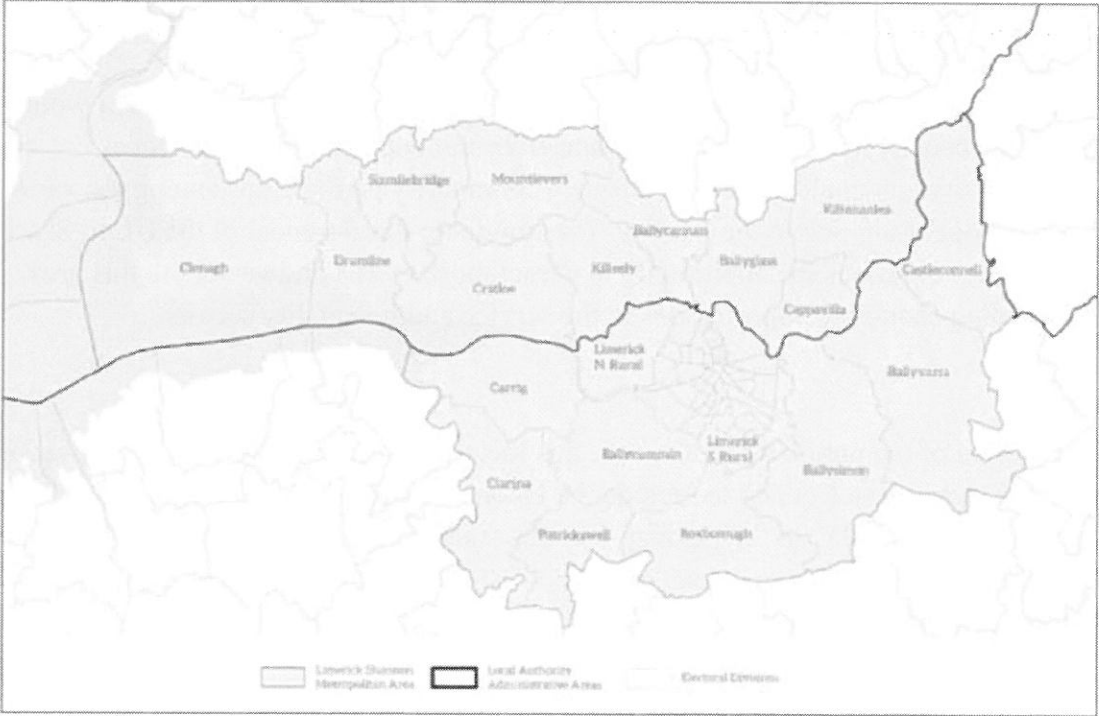
Figure 4.1 Limerick-Shannon Metropolitan Area