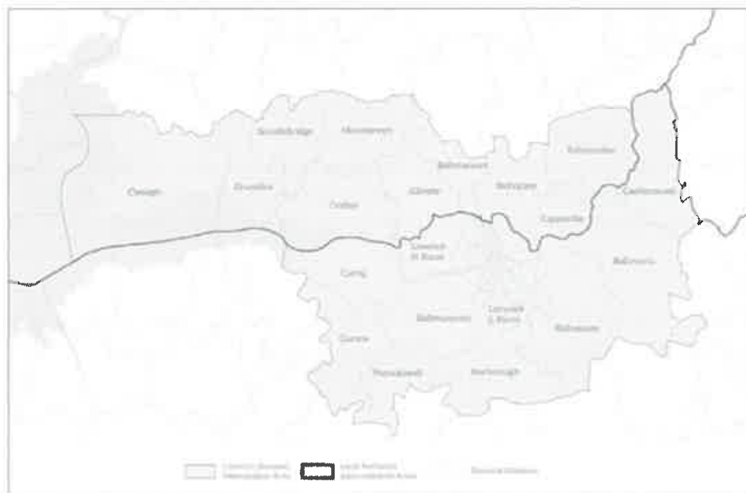
Figure 4.1 Limerick-Shannon Metropolitan Area