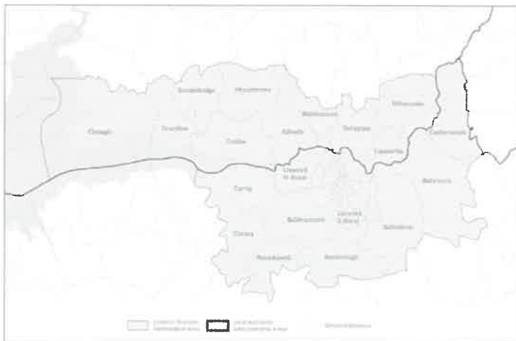
Figure 4.1 Limerick-Shannon Metropolitan Area