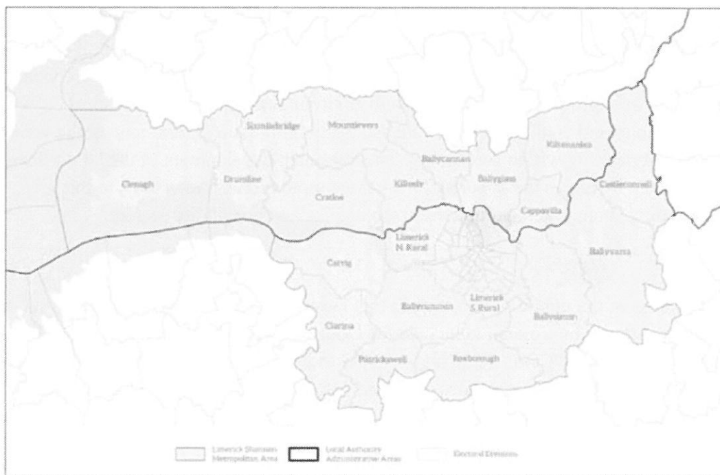
Figure 4.1 Limerick-Shannon Metropolitan Area