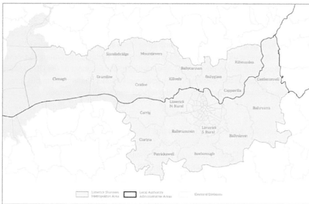
Figure 4.1 Limerick-Shannon Metropolitan Area