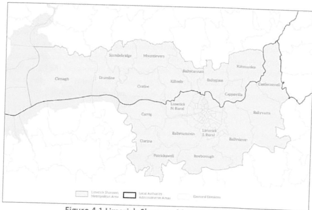
Figure 4.1 Limerick-Shannon Metropolitan Area