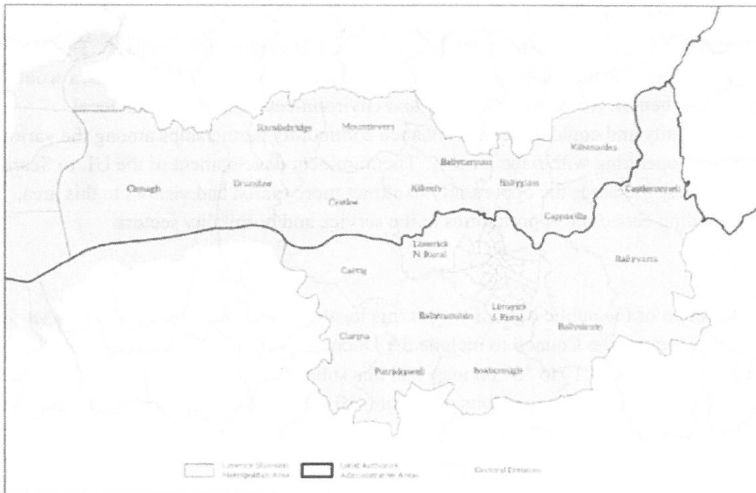
Figure 4.1 Limerick-Shannon Metropolitan Area