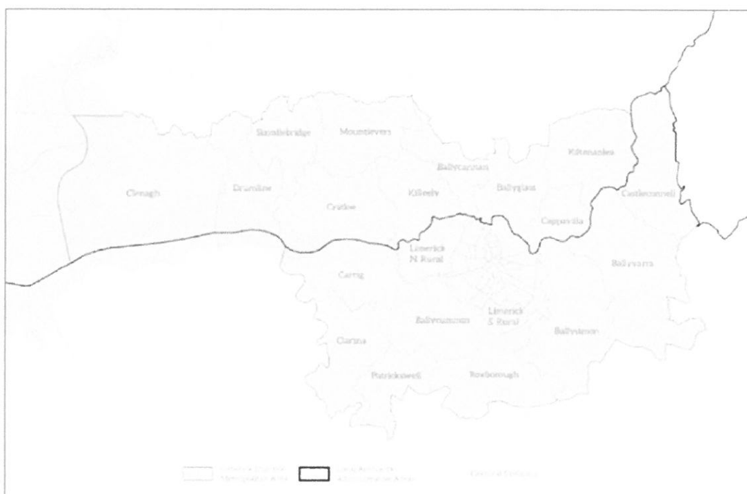
Figure 4.1 Limerick-Shannon Metropolitan Area