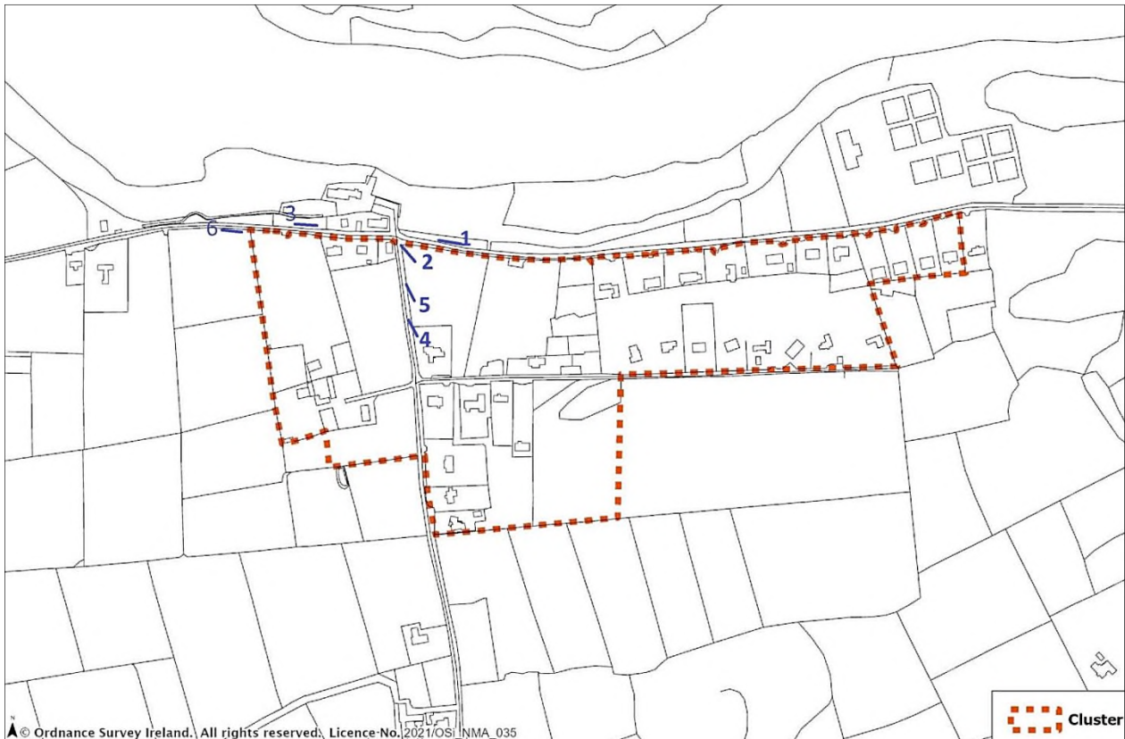
Fig 4. Key to photographs

The following survey is derived from Google Street View images, photographed in July, 2019. The key shows the approximate position and direction of view of six photographs focused on the north-west corner of the designated New Quay cluster, the area which is the subject of this submission. The short text below summarises relevant aspects of each image.