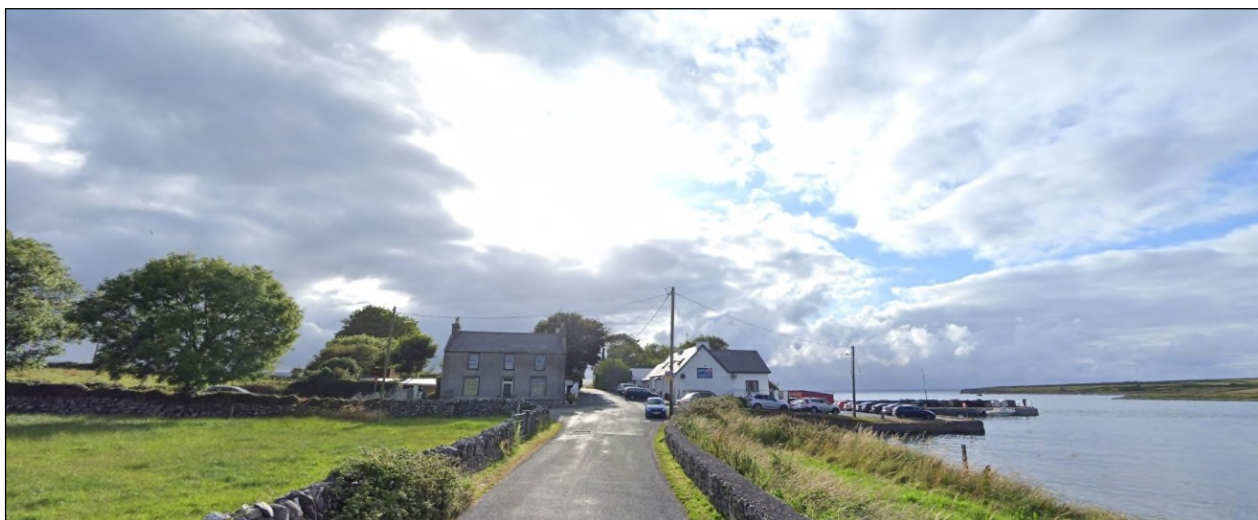
Fig 3 The cross-roads at New Quay viewed from the east. In the original designation, land both sides of the cross-roads was in the cluster. Now, on the far side of the cross-roads, the roadway is the cluster boundary and property on the seaside of the road is outside the cluster (Image from Google Street View, photographed in July 2019)