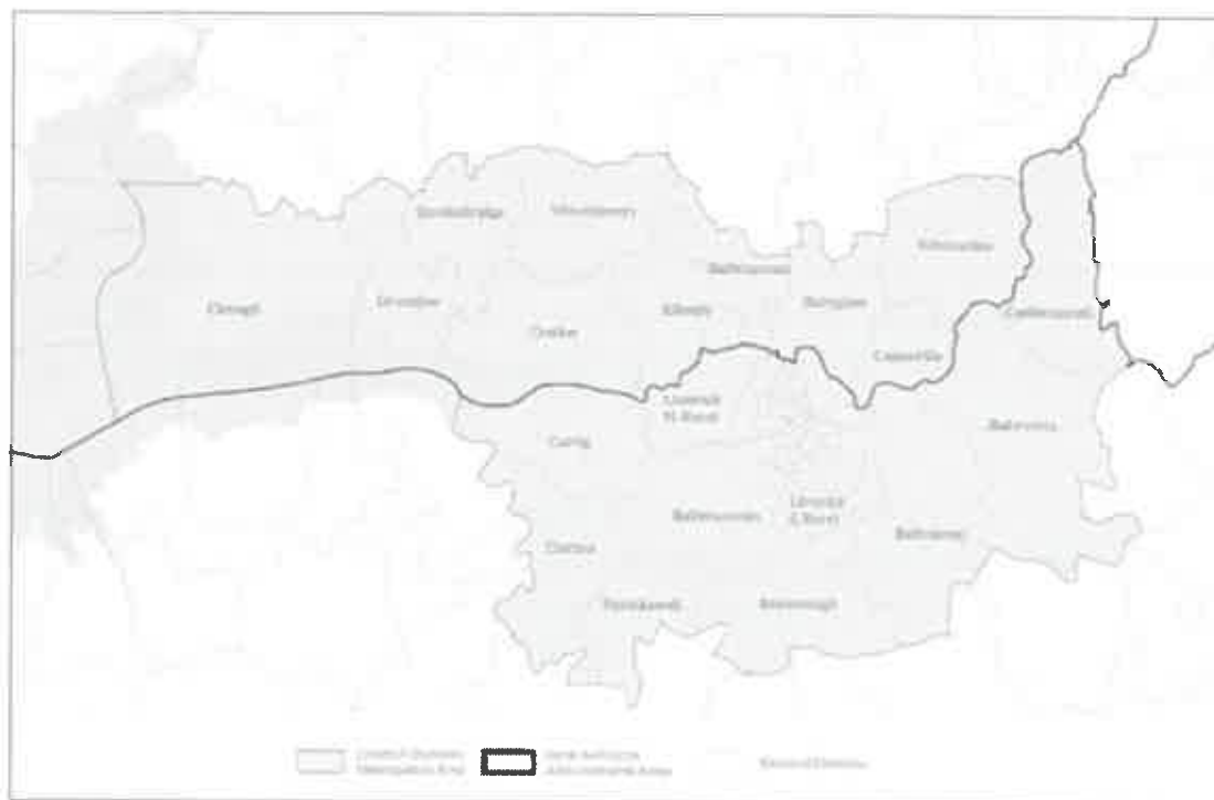
Figure 4.1 Limerick-Shannon Metropolitan Area