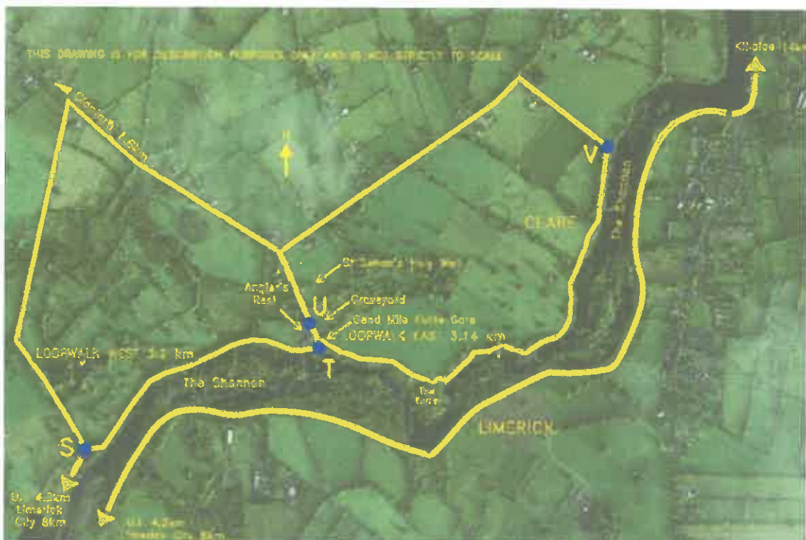
Map 1: Doonass looped walks

This route is shown on the map set out below. The route starts south east of Clonlara and follows the public road going southwards towards the River Shannon as far as the southern boundary of the public road (marked “U” on Map 1 below) then south thereafter running to the east of the building known as the Angler’s Rest as far as the River Shannon (marked “T” on the map below) and then east through the stile at “The Céad Mile Fáilte” to the public footbridge crossing that leads to Castleconnell (marked “V” on the map below) and west to the junction with the public Road at Illaunyregan (marked “S” on the map below).