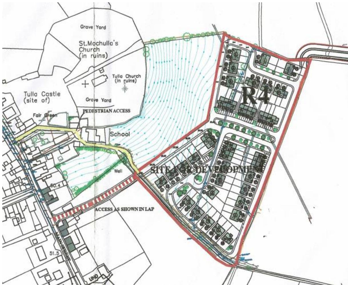
Feasibility Study with up 72 dwelling houses, access road and scenic pedestrian link.