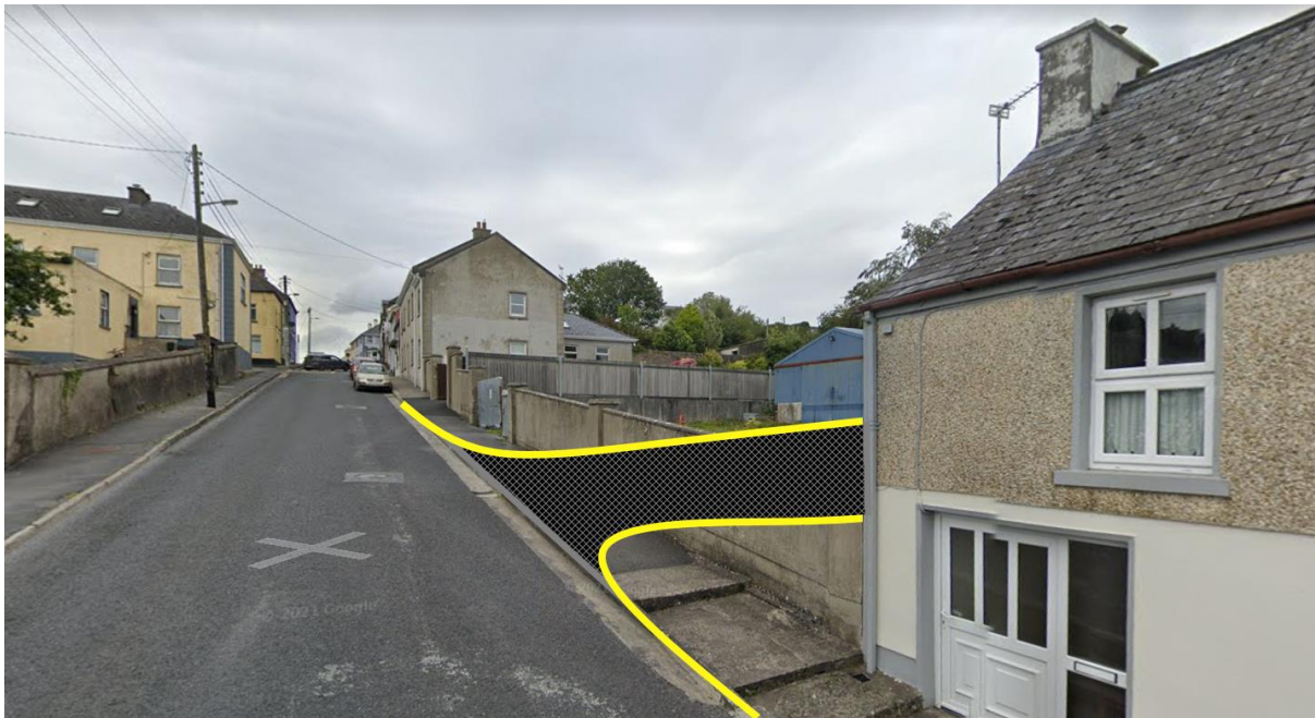
Image with access road

The subject lands have access via the public road. There are lands available to allow for the widening of this access road to the Planning Authority's requirements. In summary, the lands will be immediately accessible to and from the village of Tulla.