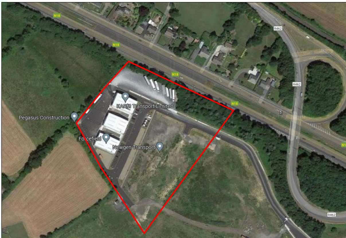
Figure 2 - Site Context (indicative only)

The Planning Authority will note that the road network in the Park, as illustrated in Figure 2 below, includes for spurs for future development. More information in relation to expansion is set out in the Planning History Section below.