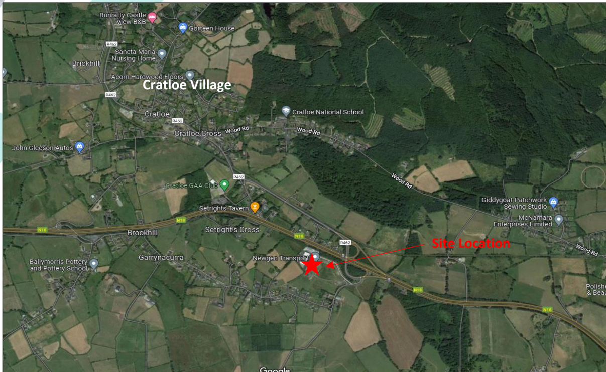
Figure 1- Site Location

The subject lands are located to the south of the N18 Dual Carriageway, a short distance to the southeast of the village of Cratloe. The site is strategically located approximately 10km to the west of the Limerick City, 17km to the east of Shannon Airport, 42 km to the port of Foynes, 30km to Ennis and 90km to Galway. It's location in close proximity to Limerick allows for easy access to Dublin via the M7. The location of the subject lands is illustrated in Figure 1 below.