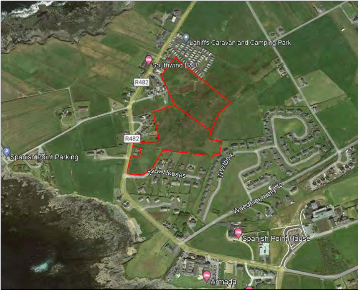
Figure 1: Location of the Subject Lands in Spanish Point

The site is greenfield in nature and is not currently in use. The site currently consists of grassland with some overgrown scrub. The boundaries include rendered block wall and wire fence. A recorded monument is located close to the North-eastern corner of the land holding. The site is not located within any EU or nationally designated site.