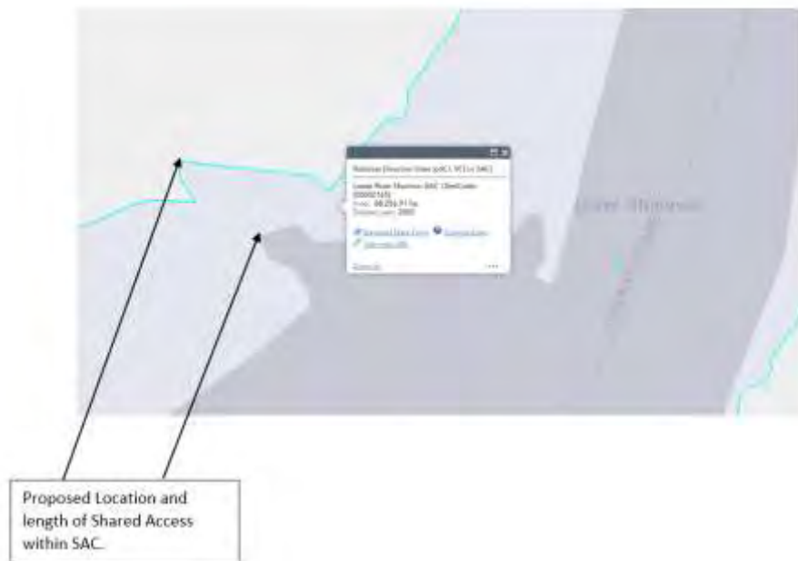
Figure 2- Our Client's Proposal within Designated cSAC site from Natura 2000 Network Viewer

The lands are located on the northern shores of the River Shannon just south of Killaloe town in Co. Clare. Our client's land the subject of this submission falls within the lower River Shannon cSAC boundary as illustrated in figure 2 below. We are aware that this provides significant obstacles to development proceeding that might impact negatively on this or any other European Designated Site.