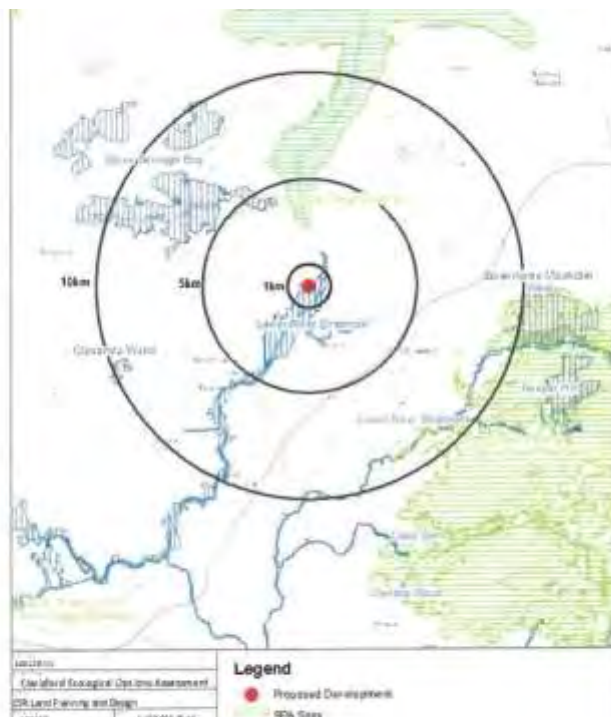
Figure 3- cSACs and SPAs within 15km of client's site from 2014 Ecological Options Assessment