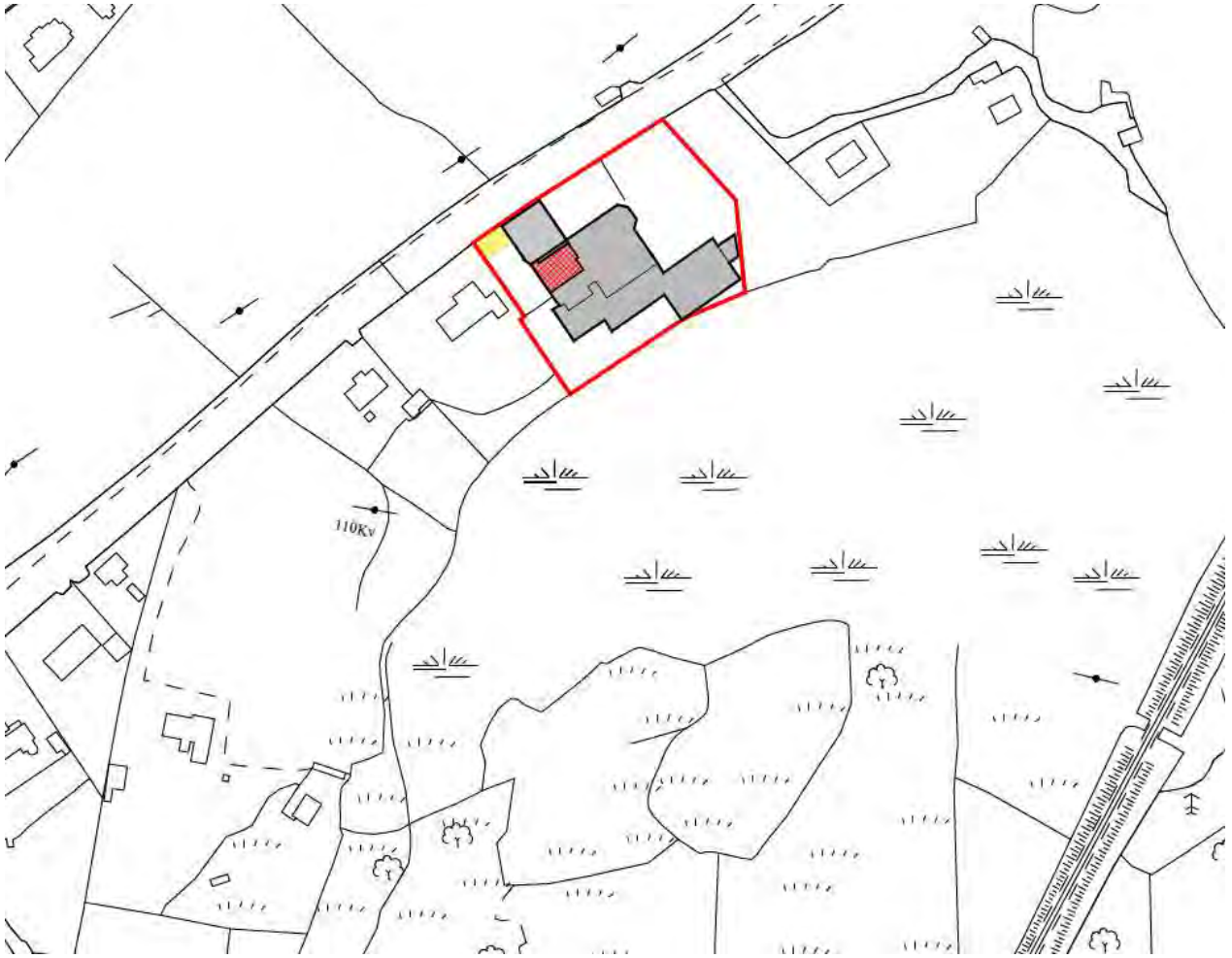
Figure 1 – Site Location Plan – Subject Site outlined in Red