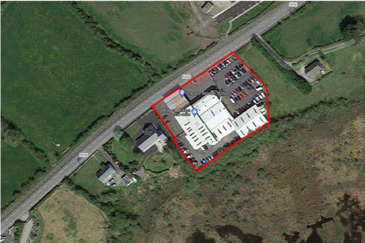
Figure 2 – Aerial Image of Site outlined in red.