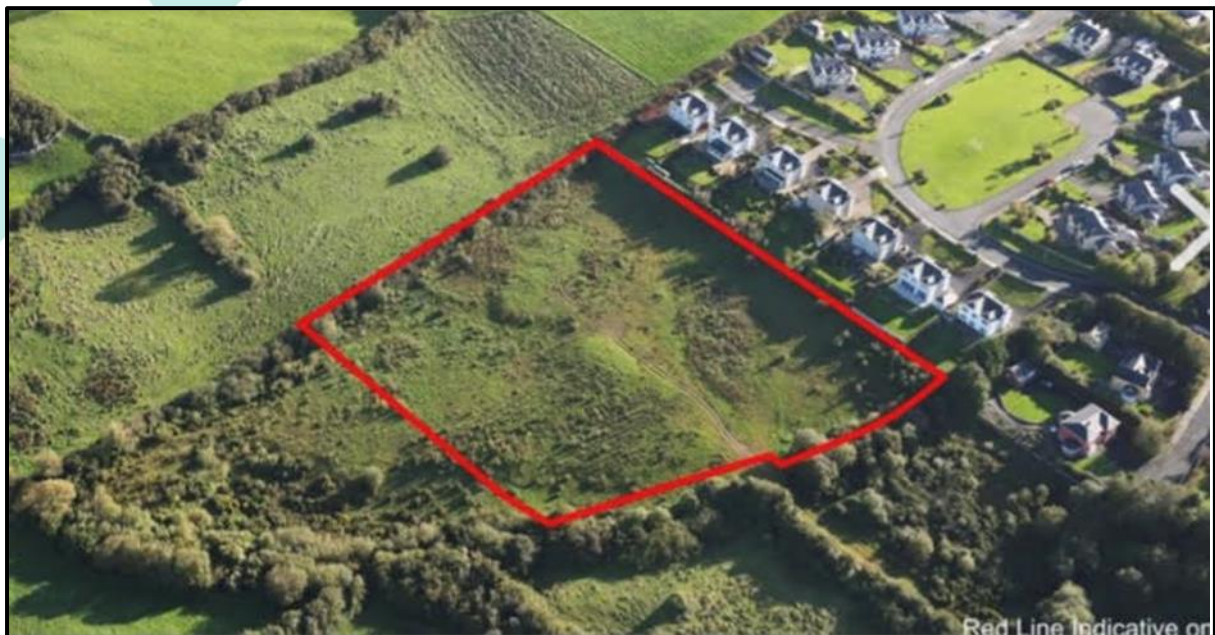
Figure 1: Aerial Image of Subject Lands

This submission relates to lands at Woodstock, Ennis, Co. Clare, as identified in Figures 1 & 2 below. The subject lands extend to approximately 1.5 hectares and are located in the neighbourhood of Shanaway Road/Woodstock. They are located to the north of the Woodstock View/Woodstock Hill residential estate. The lands are accessed via an existing road which links them to the Shanaway Road. This access point is located adjacent to the Garville Court residential development.