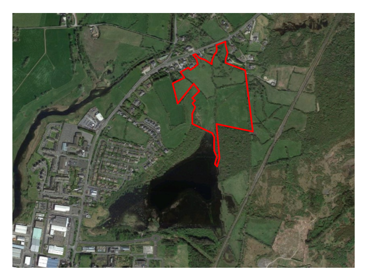
Figure 1.1: Indicative extent of subject lands