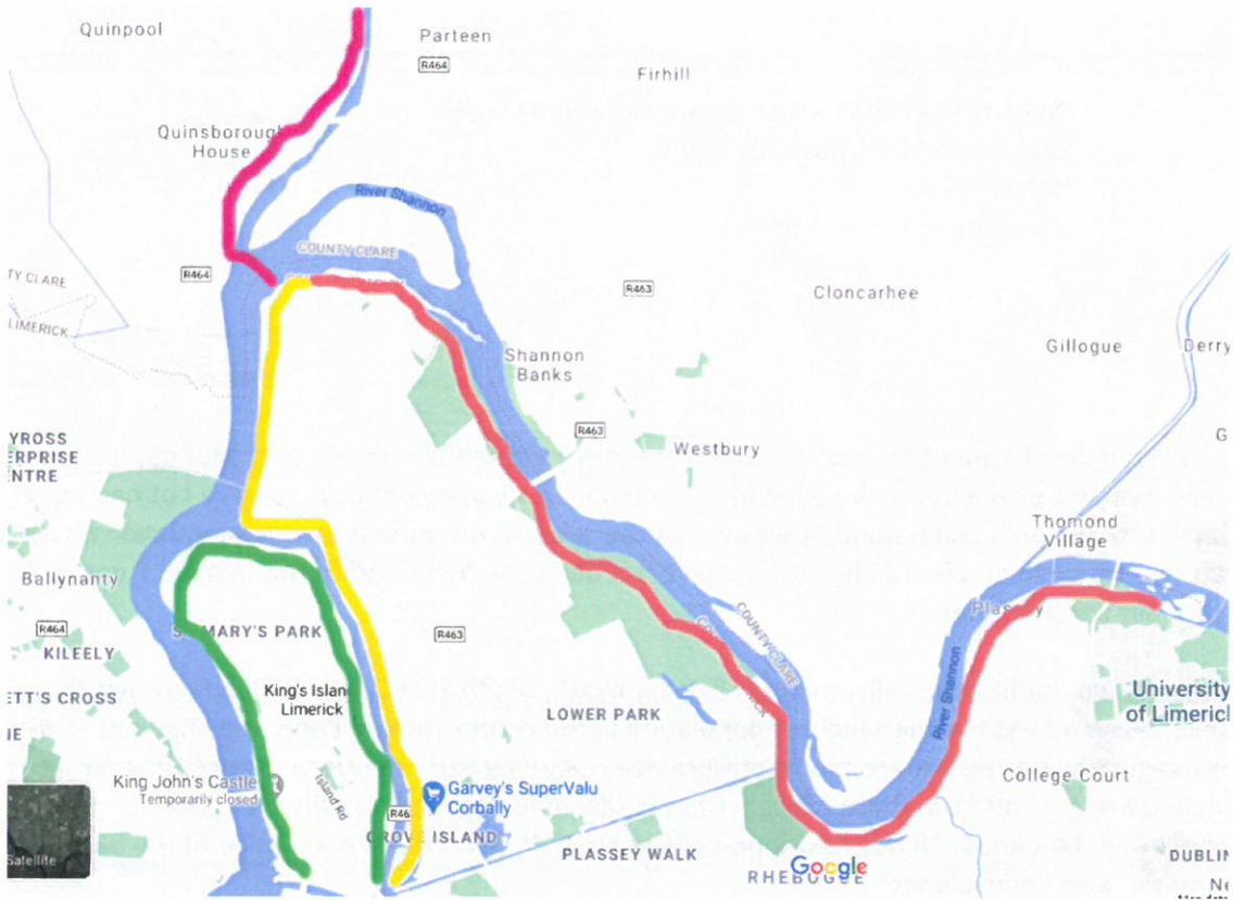
Pic 2 = South East clare. Purple route being the proposed greenway from O Briens Bridge to Long Pavement.