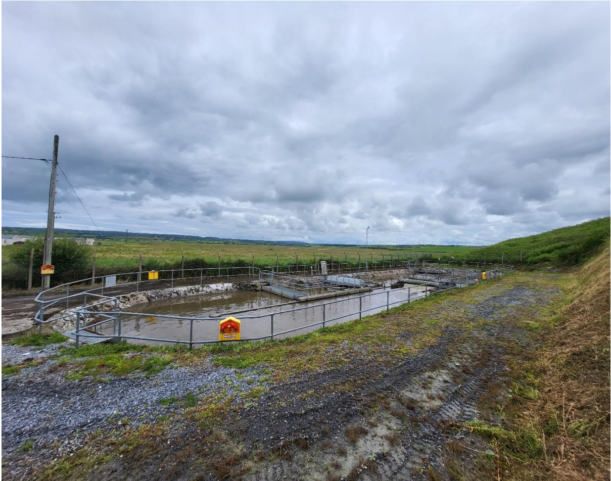
Photograph No. 1: Overview of the oxidation ditch of the Lahinch Wastewater Treatment Plant.