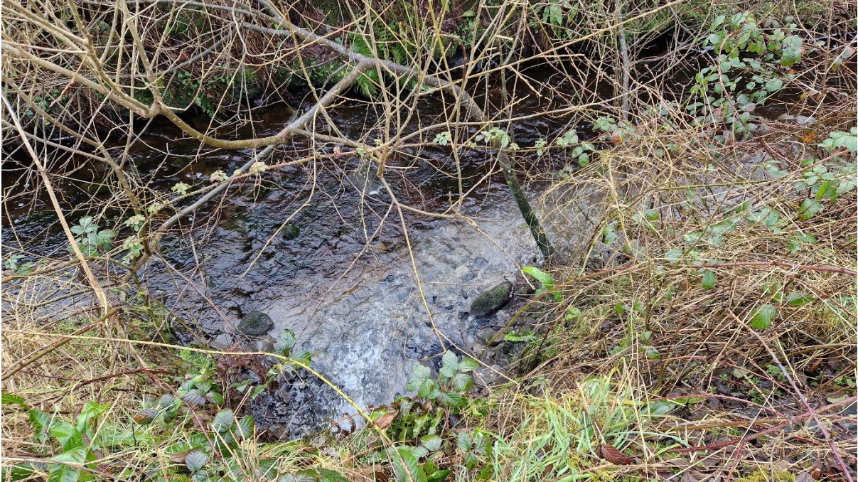
Photograph No. 1: Discoloration and sewage fungus in the river bed at the final discharge point.