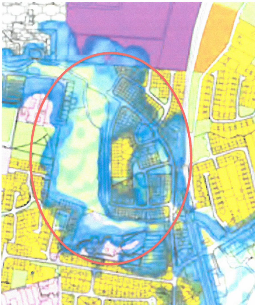
Extract from Clare Development Plan map 2023-2024 showing Corrovorrin area as Flood Zones A & B along with open space zoning of field behind Corrovorrin Drive