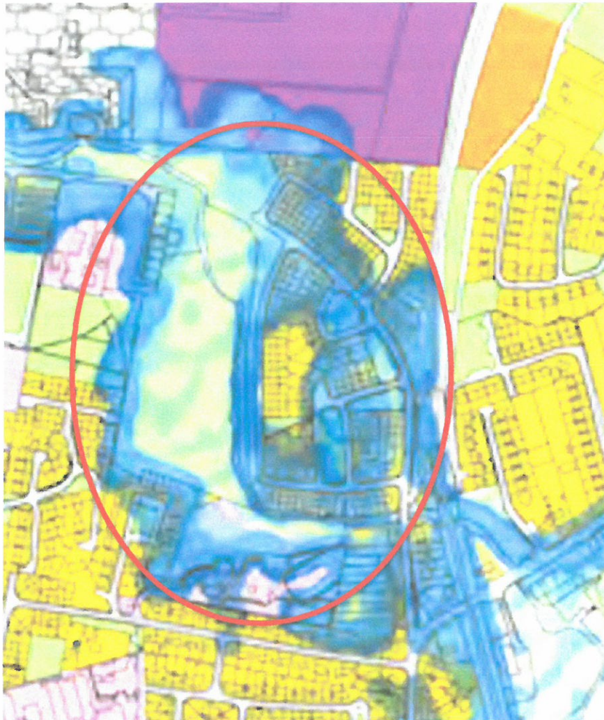
Extract from Clare Development Plan map 2023-2024 showing Corrovorrin area as Flood Zones A & B along with open space zoning of field behind Corrovorrin Drive