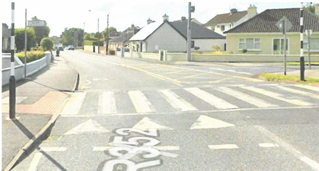
Zebra crossing on Tulla Road and signage for route through to Gort Road

The junction of the Tulla Road and Kevin Barry Avenue is constantly busy due to the shop on the corner. There are 14 parking spaces, and cars also park on the opposite side of the road, sometimes on the pavement, when there are no spaces available. There are vehicles reversing in and out of spaces and this leads to significant congestion at times. To add a cycle/walking route into this area would be hazardous to anybody trying to use it. There is a zebra crossing just past this junction which would provide safe access from the Tulla Road to St Senan's Road where there is a sign posted cycle and walking route to both the Gort Road and Ivy Hill.