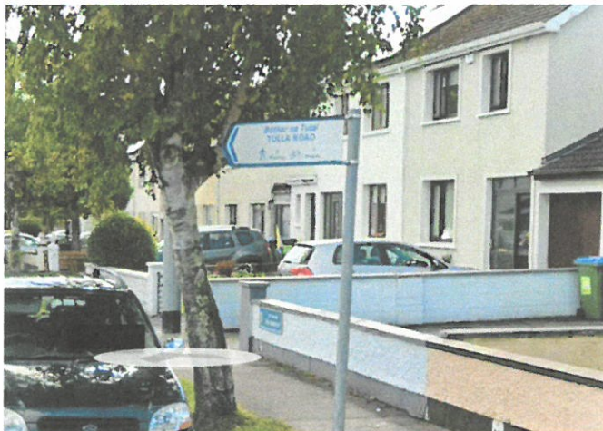
Signage on The Crescent indicating walking & cycling times from Gort Road to Tulla Road

There is an existing cycle/walking route from the Tulla Road through to the Gort Road and Ivy Hill, which is clearly sign posted with walking and cycling times. This route is well used by many on a daily basis. Surely the best use of existing infrastructure would be to connect the newly developed cycle route on the Tulla Road to the existing cycle route running down St Senan's Road and The Crescent through to the Gort Road, especially considering the new cycle route works will be finishing at the junction of Kevin Barry Avenue and the Tulla Road.