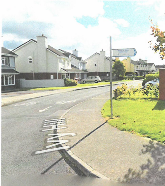
Signage on Ivy Hill showing walking & cycling times from Tulla Road to Gort Road and vice versa