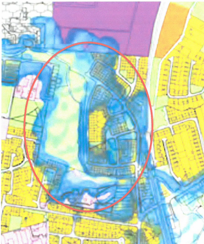
Extract from Clare Development Plan map 2023-2024 showing Corrovorrin area as Flood Zones A & B along with open space zoning of field behind Corrovorrin Drive