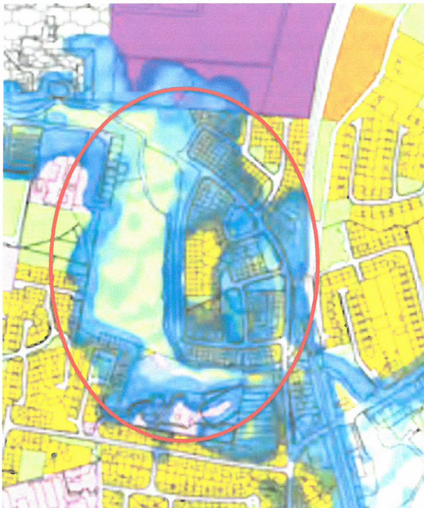
Extract from Clare Development Plan map 2023-2024 showing Corrovorrin area as Flood Zones A & B along with open space zoning of field behind Corrovorrin Drive